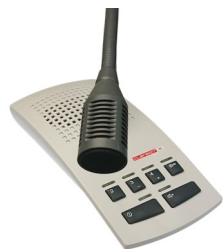
Microphone-loudspeaker unit RAL Colour 7035 Label 32.054.440.001