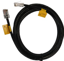
RJ45 patch cable KAT5e, 3m labels 32.054.327.001, 32.054.327.002