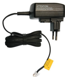
Power supply GPP10 Medical, 100-240V~/50-60Hz, 2m cable, labels 32.054.803.001, 32.054.803.002