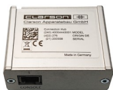
Connection Hub Label 32.054.014.004